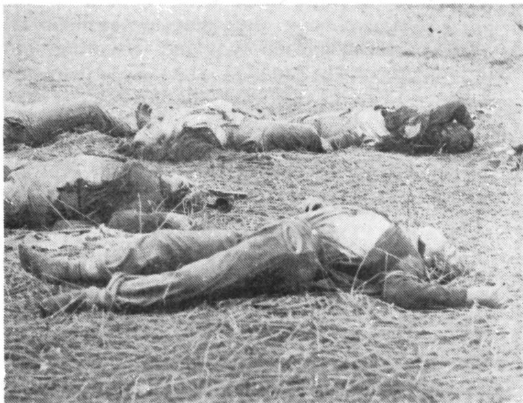
Civil War victims. Thousands were slain by Central Government in its war to protect itself against we the people!

Perhaps the greatest example of the Soviet style purges that have happened in America happened in the 1860's. It is popularly called "The Civil War." It was actually a Stalin style purge for the purpose of strengthening and protecting Central Government. In