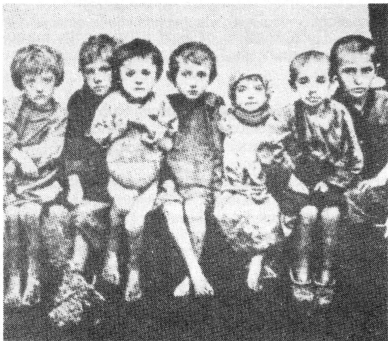
The fatherless — victims of Stalin's forced starvation of Ukrainians to make Russia safe for Central Government.

Central Government can be cruel in its efforts to control the people. For instance, during Joseph Stalin's tenure as the head of the Soviet Union's Central Government, during the 1930's, 40's and 50's, he instituted several "purges" to get rid of, or control, "the rebels." Historians estimate that over 50 million Soviet citizens died from starvation, executions and disease as a result of these purges. Millions more suffered imprisonment, degradation, loss of all property and hope.